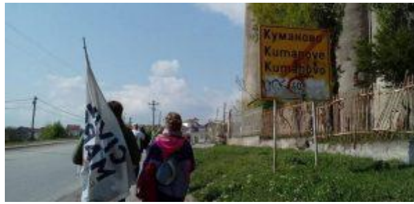
March passed through Macedonia in April

"I think now I know much more about the Balkans than before and I got a picture about the region. Now I know more about the links between different ethnic groups, their history and sensitivity. For example, I did not have any idea how popular was the name dispute between Macedonia and Greece. Even if you hear about such things in Poland, it's hard to imagine the intensity, how sensitive it is," he joked.